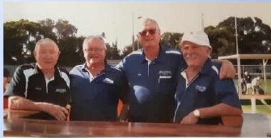
The Awesome Foursome