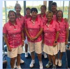
Ladies in PINK at Leeming