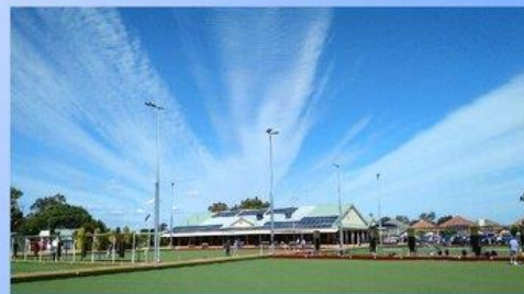
Great photo sent in by Gene Sputtore