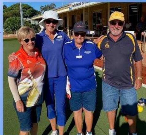
Three Ladies and a Man

Picture taken during a Scroungers game played recently.