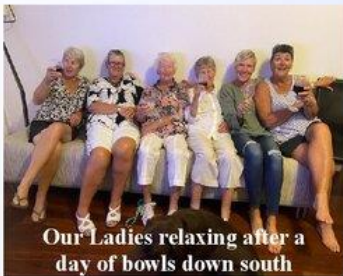
Our Ladies relaxing after a day of bowls down south