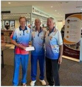
Winners circle at Port Bouvard