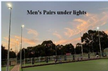
Men's Pairs under lights