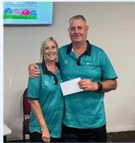
Winners circle at Mandurah