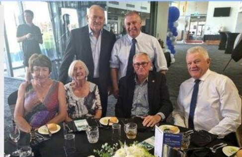
HHBC at the recent Sports Award presentation evening