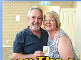
chase The ACE Jackpot $650

Live music and raffles ★ Happy Hour 5.30-6.30pm