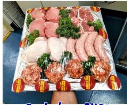
Meat Packs from GILBERTS