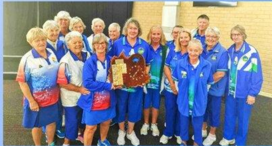
The clock challenge

The clock challenge between Div 3 Purple and Comet Bay was fiercely contested with the result being a draw!! Well done girls.