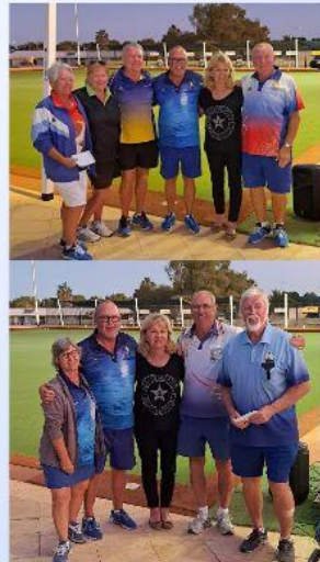
HHBC members doing well in the Farewell 4is at Exmouth Bowling Club