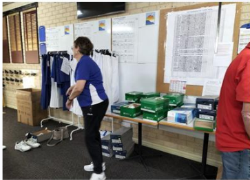
A small quantity of bowls shoes and clothing still available at the club