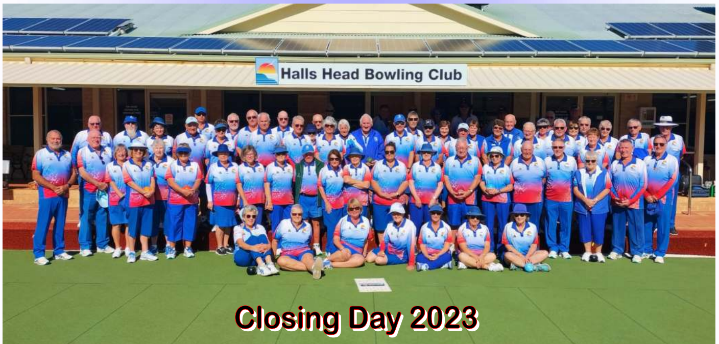
Closing Day 2023