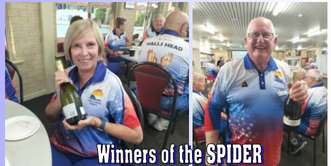
Winners of the SPIDER